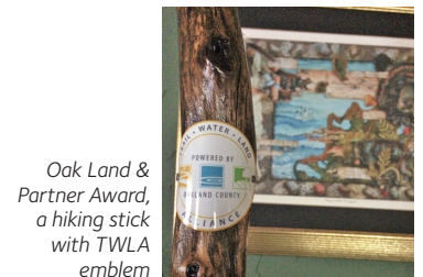
Oak Land & Partner Award, a hiking stick with TWLA emblem