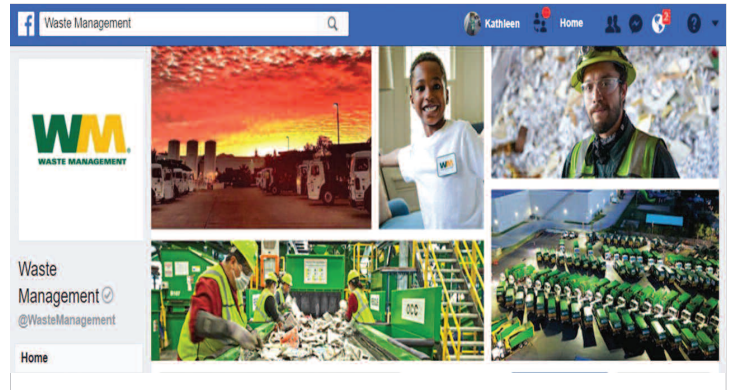
Waste Management Facebook page

Twitter links: https://twitter.com/kathyklein4 https://twitter.com/WasteManagement