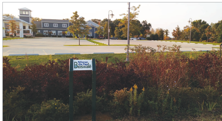
Bioswale sign at Orion Center

In its effort to educate community members about important “sustainability” initiatives taking place in land development, Waste Management funded the production and installation of the “BIOSWALE” signage at the Orion Center. The sign is meant to draw public attention to the important role that bioswales play in protecting the environment while also accommodating development. Green infrastructure measures are being adopted in private, public and community development across